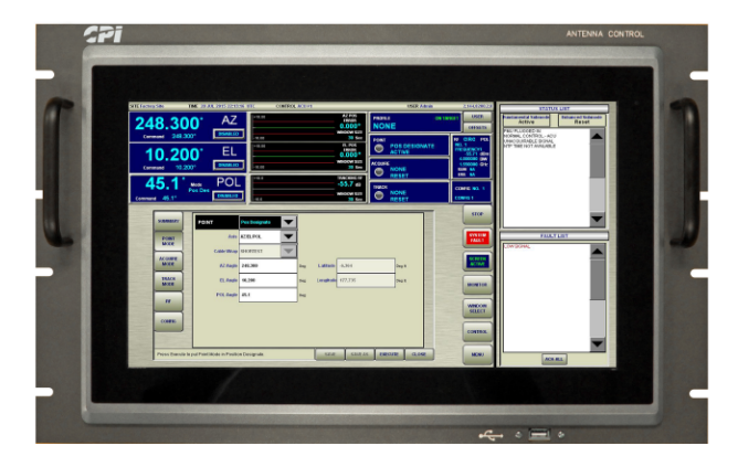
7RU ACU with 15 Inch Touch Screen

The Antenna Control Unit (ACU) is the primary control and monitor interface point for the entire system, featuring a friendly touch screen windowed interface.